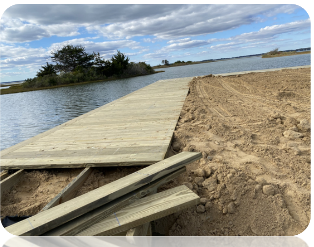
BOARDWALK AND BULKHEAD REPLACMENT - NPS, MD